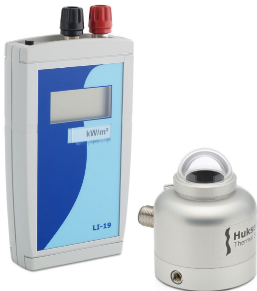
Figure 1 SR05-A1 pyranometer with LI19 handheld read-out unit / datalogger.

SR05 is a solar radiation sensor that is applied in most common solar radiation observations. SR05-A1, with analogue millivolt output, complies with the spectrally flat Class C specifications of the ISO 9060 standard and the WMO Guide. LI19 is a high-accuracy handheld read-out unit / datalogger. The SR05-LI19 combination is well suited for mobile measurements and short term datalogging.