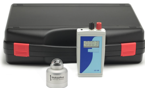
Figure 2 SR05-LI19 as it is delivered, in a practical transport case.