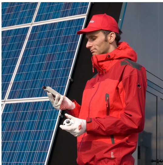
Figure 4 LI19 used with a pyranometer in a field measurement campaign.